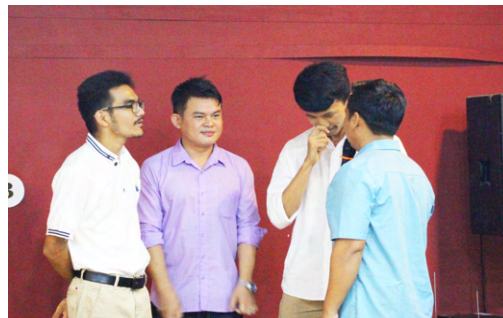
Contemporary Gospel Drama (M.Div I)

June 24, 2022 was Freshers' Day, where the whole community of MEGST took delight in welcoming new students.