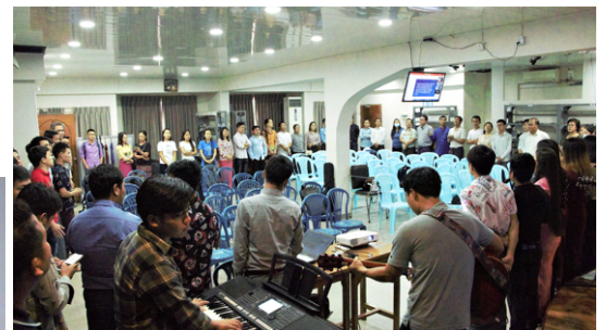
Praying for the well-being of Myanmar

The afternoon of July 22 was set aside for Prayer Day. The whole community met together and fervently prayed for the well-being of Myanmar and for the deliverance from the ongoing crisis, as well as for other countries that face similar issues. Prayer items also included MEGST family, students, main sponsors, faculty members, staff, the board committee, alumni and new apartments.