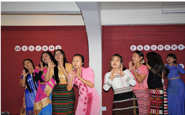
Dancing Myanmar Ethnic Gospel song (M.Div III)

June 24, 2022 was Freshers' Day, where the whole community of MEGST took delight in welcoming new students.